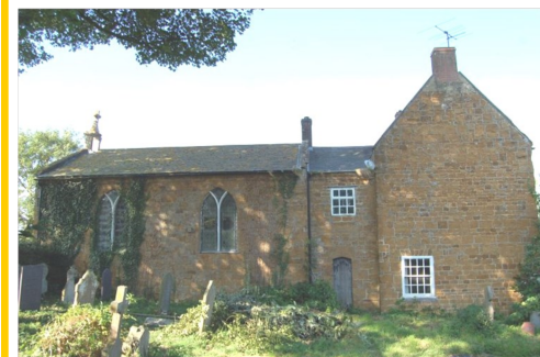
View of Eastwell not very often seen