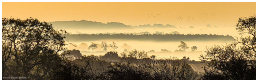
by Estelle Slegers Helsen of Waltham - see www.newtraces.uk .