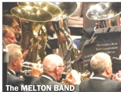
The MELTON BAND