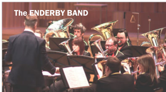
The ENDERBY BAND