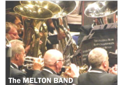
The MELTON BAND