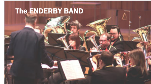
The ENDERBY BAND