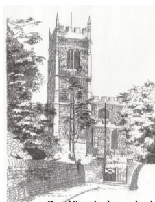
Scaford church drawn by Brian Hollingshead