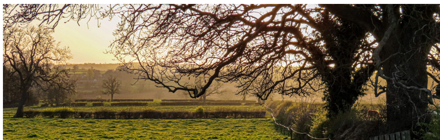
by Estelle Slegers Helsen of Waltham - see www.newtraces.uk .

Please may I have all items for September by FRIDAY, 20th AUGUST