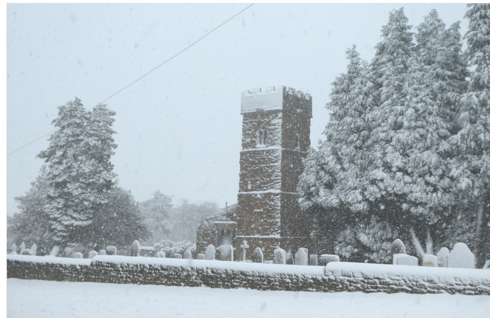
A photograph of Eastwell church in recent snowfall (mid December time)