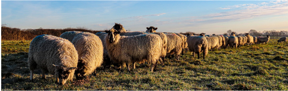
by Estelle Slegers Helsen of Waltham - see www.newtraces.uk