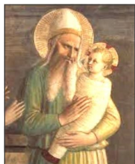
Simeon and the Christ Child