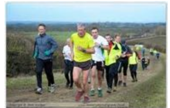
The Belvoir Challenge is being held on Saturday, 25th February this year.

Martin's (of Asfordby), Long distance or local journeys. Airport transfer specialist. 01664 513000 or 07951 840018