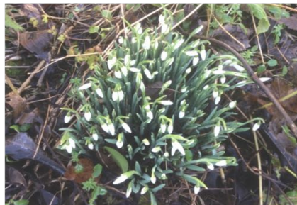
The first snowdrops in bud in Eastwell churchyard

I must apologise both for the late delivery of last month's and also for the fact that we had to ration them, as there weren't enough to go round ..... all due to a combination of things. An opportune moment to say thank you to those who deliver them round the villages - they never really know when to expect them.