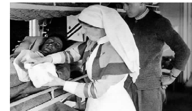
A nurse dressing the wounds of French and British soldiers.