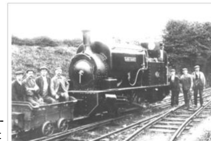
Lord Granby in operation

Everyone is invited and we shall be able to show the fruits of the labours of a very dedicated team of conservators. 'Lord Granby' is not being returned to steam and will be a 'static' exhibit for display, effectively in ex-works condition. It will undoubtedly be in the best condition since soon after manufacture in 1904.