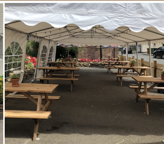
THE KINGS ARMS, SCALFORD