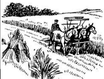
THE SEEDTIME AND THE HARVEST