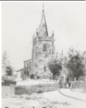
Drawing by Brian Hollinshead